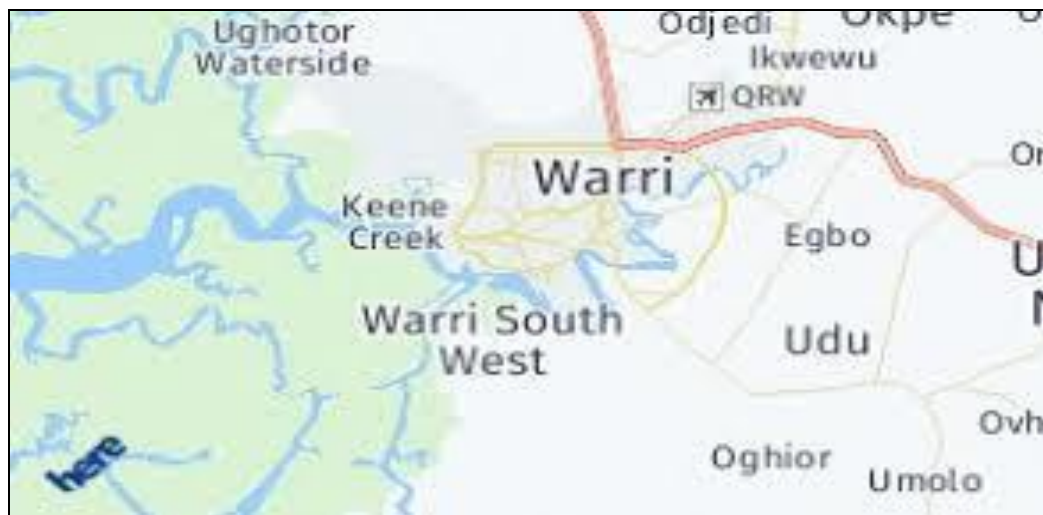
Fig 1: Map of Warri South LGA showing sampling Point

The study area Maciver market is in Warri South Local Government Area of Delta State. It lies between Latitude 5° 3'5. 11" N and Longitude 5°40'44. 11" E, altitude 13.5 – 17.5 m. The area is in oil rich Niger Delta-Nigeria and as such, the major activities are characterized by oil & gas exploration activities from Chevron Nigeria Limited, petrochemical refining from the Warri Refinery and Petrochemical Company, a subsidiary of Nigerian National Petroleum Corporation (NNPC) and allied companies. The economic activities of these companies has undoubtedly increased human population and thus, dumping of waste materials directly into the river, mainly from Delta Development Property Agency (DDPA). Others are aquaculture business along the river stretch, auto-mechanic workshops, wood-logging, cloth washing, bathing and swimming.